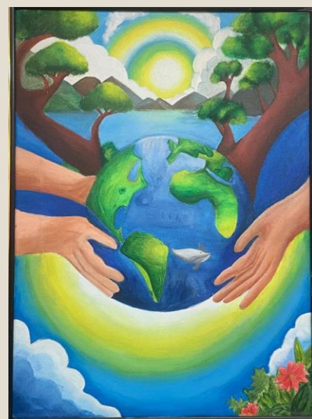
Aadya Khandelwal Class - X B